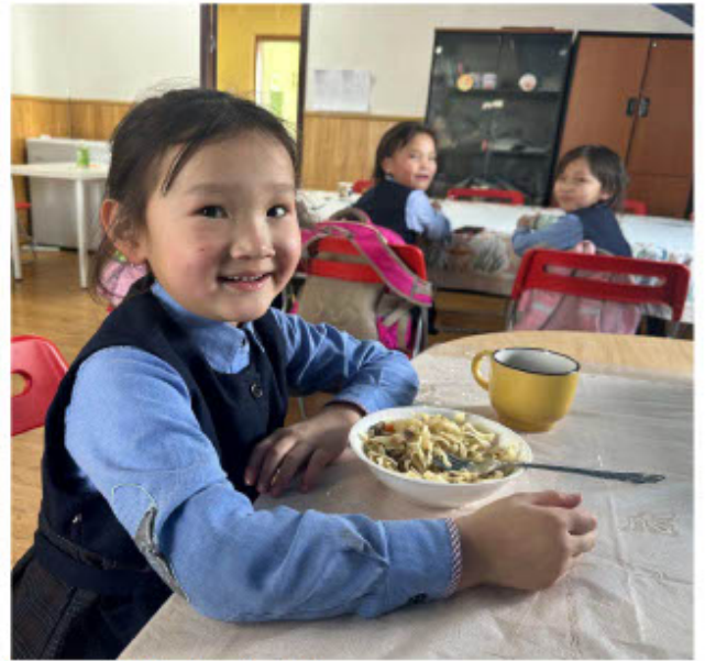
Pictured above and at right are some of the children in our newest feeding center. Most all of them are hearing the gospel for the first time.