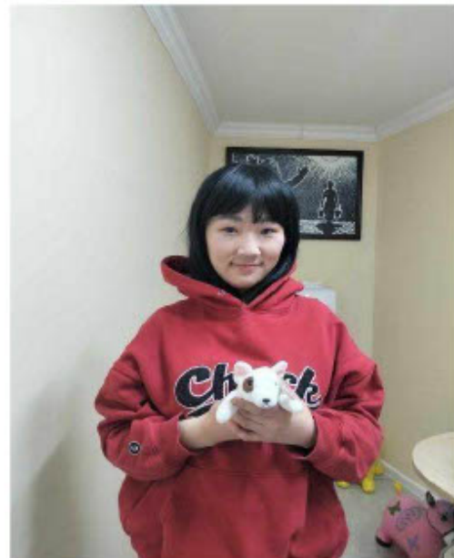
The two young ladies pictured above are some of the most recent clients to visit one of our prolife centers. You can see how young most of them are that come through the doors. We give them all a free ultrasound, a beanie baby for their unborn child's first doll, and a big serving of the gospel.