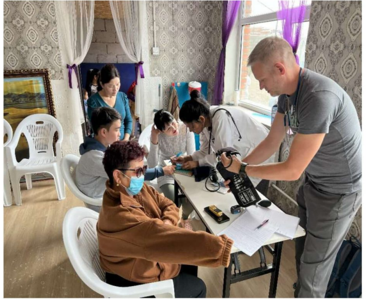
Top, right and lower photos are of the medical group that ministered to hundreds last month. We looked at adults and children.