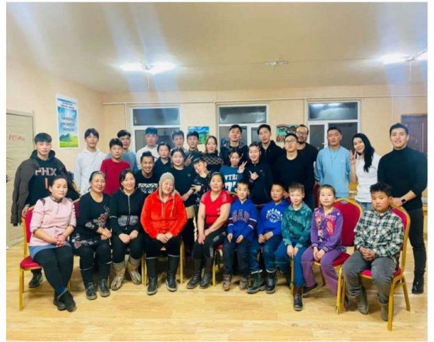
Pictured above are two pictures of our Gobi Desert church members in two separate villages.