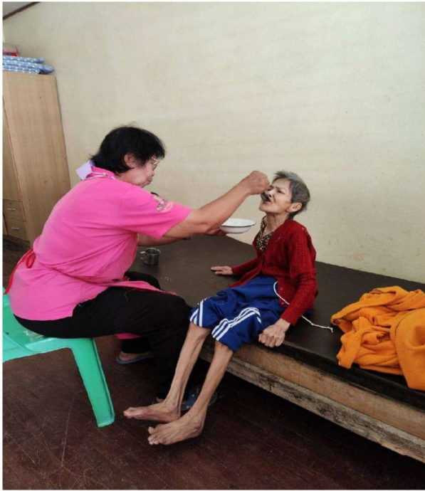
This lady pictured above, and right is dying with leprosy and now has dementia.