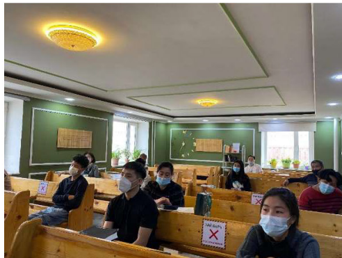
Above: Sunday service with only 10 allowed