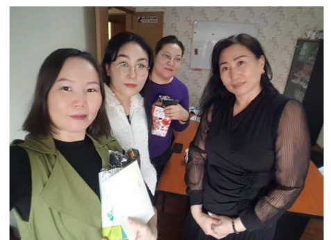
Our director and staff at one pro-life center in UB.