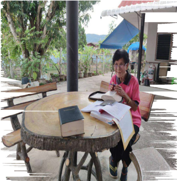
Daily Bible above and our pastor at right.

Luke 15:10 Likewise, I say unto you, there is joy in the presence of the angels of God over one sinner that repenteth.